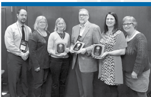
2014 PLS Award Winners